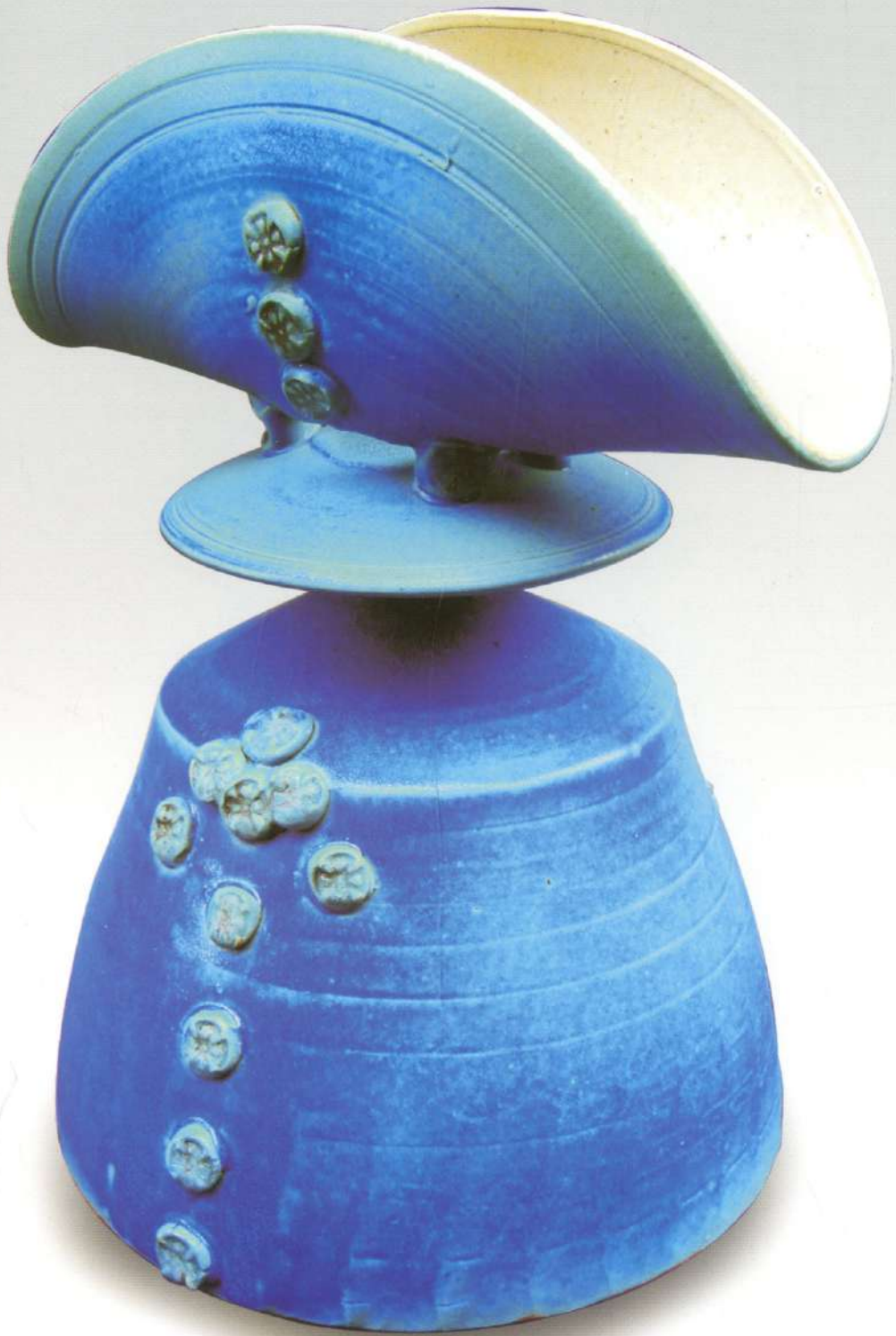
Pot "Untitled", Wheel thrown and Altered Stoneware With Copper glaze, Size-13" H