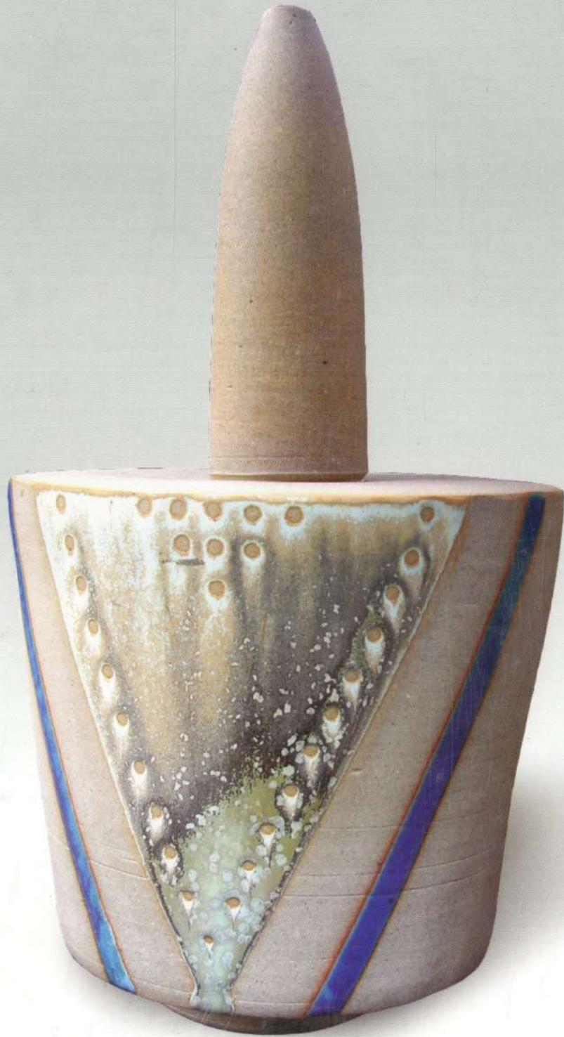
Spindle-top Series, Wheel thrown stoneware, Wax-resist Copper & Titanium Glazed, Size -13" H