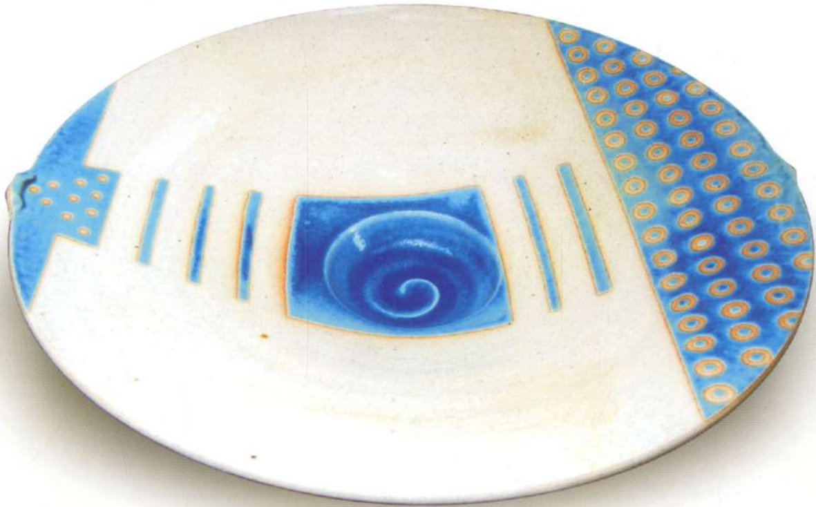
Bowl "Untitled", Stoneware, Wax-resist method Glazed, Size-11" dia

A more playful attitude is adopted with the glaze. There is the opportunity to experiment with colour on a three dimensional surface. Forms with which everyone relates: bowls, plates, vases, everyday simple objects are altered completely with respect to their function. An attempt has been made to take the form beyond the function normally associated with it. Decorating them with graphic patterns, their surface is my canvas.