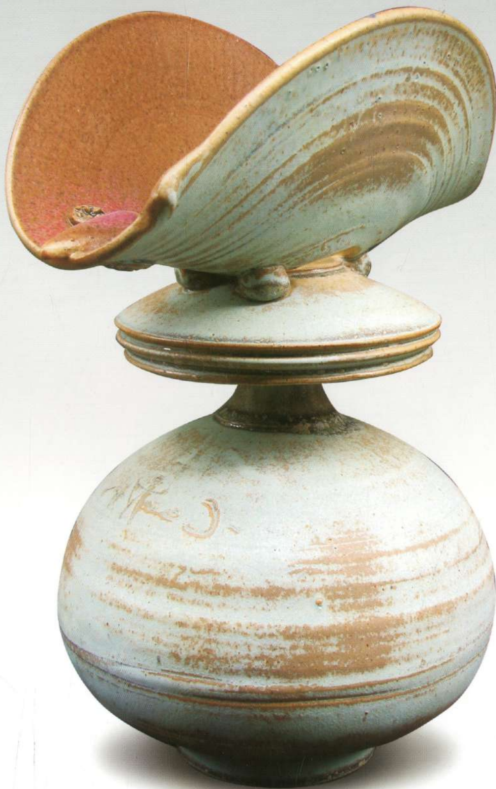
Pot "Untitled", Wheel thrown and Altered Stoneware With Copper Glaze, Size-13" H