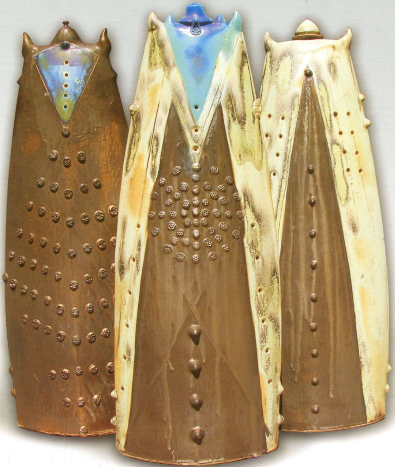
Gopuram series, Hand-built, Wheel-Thrown and Altered Stoneware with Barium & Bronze Glaze , Size-32" H (each). Year-2006