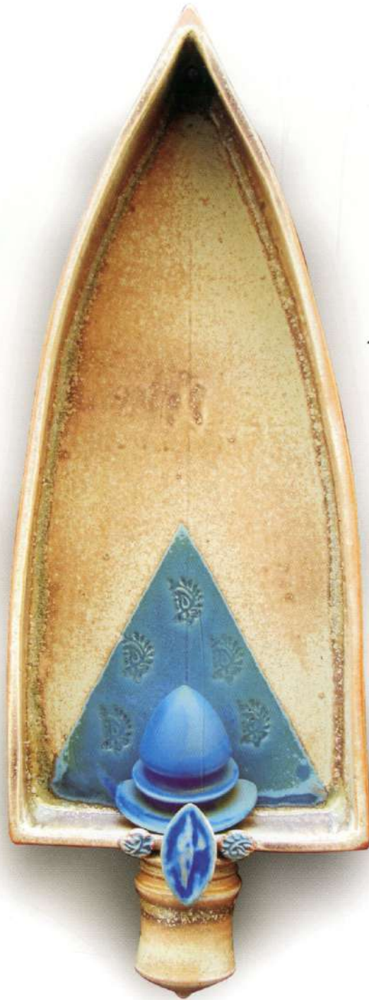
Temple series, Hand-built, Wheel-Thrown and Altered Stoneware, Size 24" H