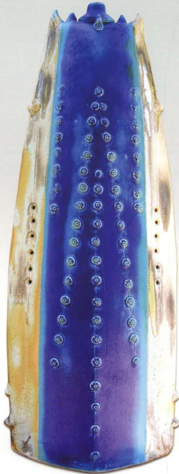
Gopuram series, Hand-Built Stoneware, Copper Glazed, Size - 32" H