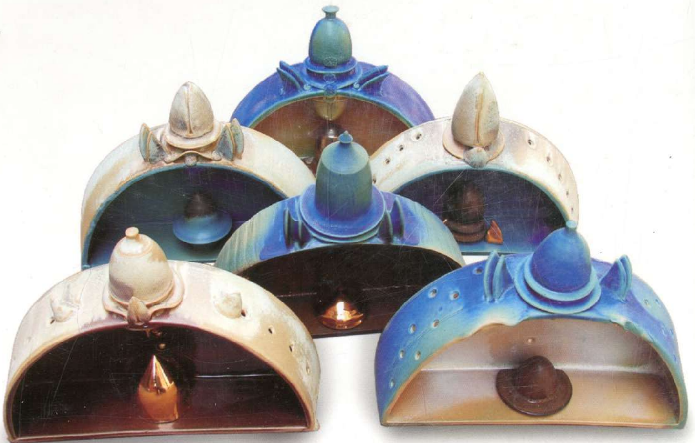
Temple series, Wheel-Thrown and Altered Stoneware with Gold Luster, Size-12" H Each

Working on the wheel, establishes a direct connection of the artist with the pot. The clay, the pot, becomes an extension of the artist himself. The artist's being is completely absorbed in the ball of the clay in between his hands and he 'creates'. It is a meditative, almost spiritual experience.