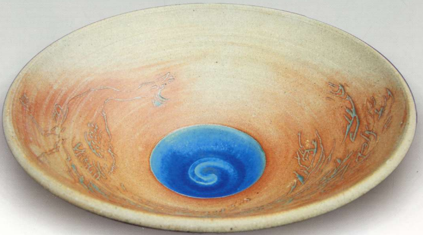
Bowl with Peacock, Stoneware, Copper Glazed, Size-11" dia