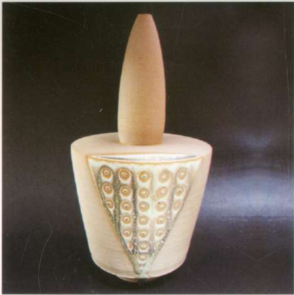
Spindle-top Series, Wheel thrown Stoneware Wax-resist Copper & Titanium Glazed Size -13" H