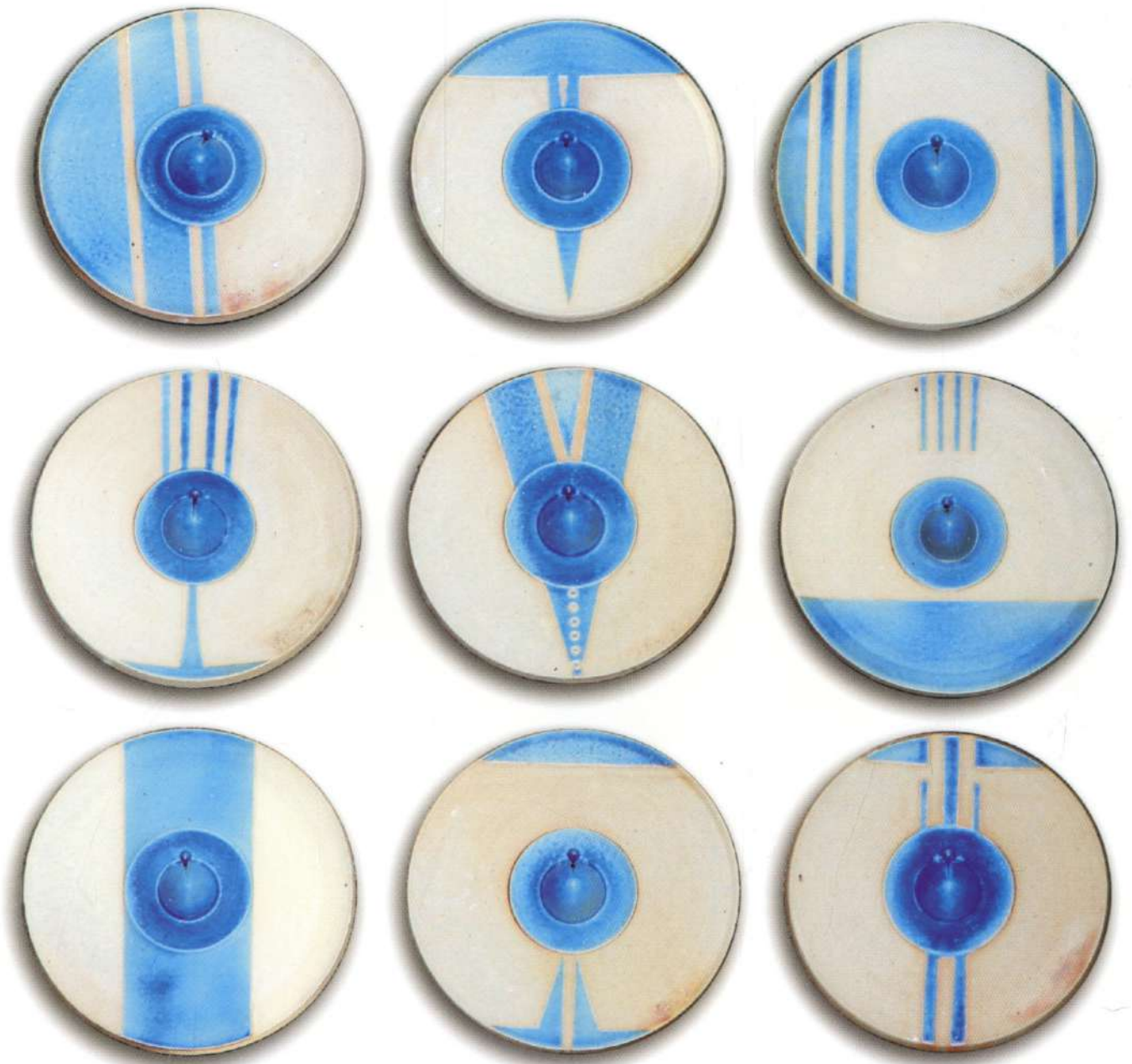
Garbagriha (temple series), Wheel-Thrown and Altered Stoneware with Barium Glaze, Size-13" Dia Each