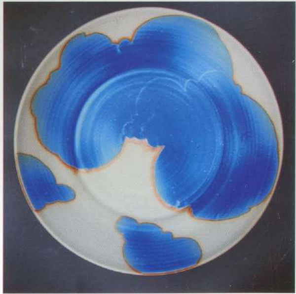
Platter "Clouds", Wax-resist Method, Barium Glazed Stoneware Size-18" dia