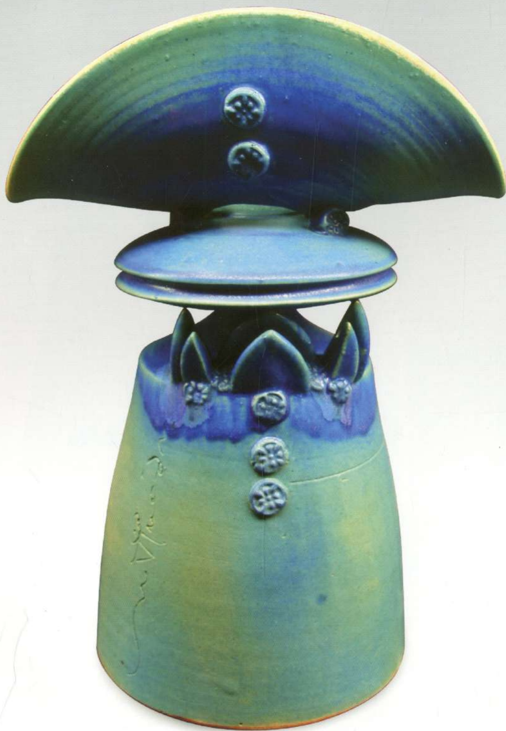
Pot "Untitled", Wheel thrown and Altered Stoneware With Copper Glaze, Size-13" H