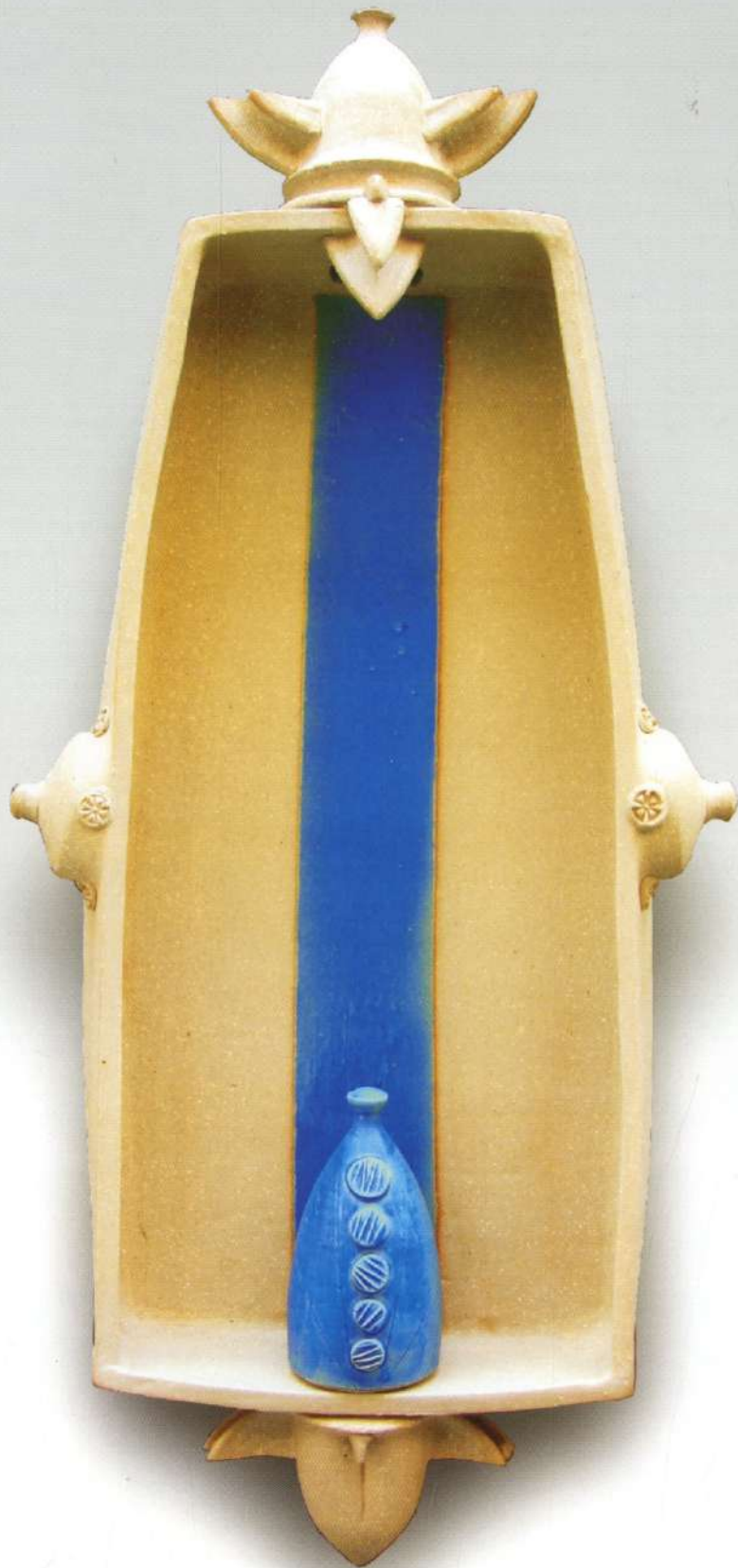
Temple series, Hand-built, Wheel-Thrown and Altered Stoneware, Size 24" H