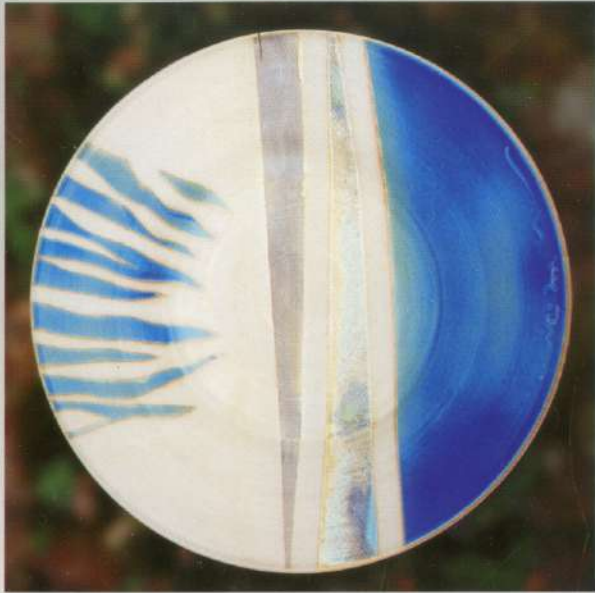
Platter "Untitled", Wax-resist Method, Glazed Stoneware Size-19" dia