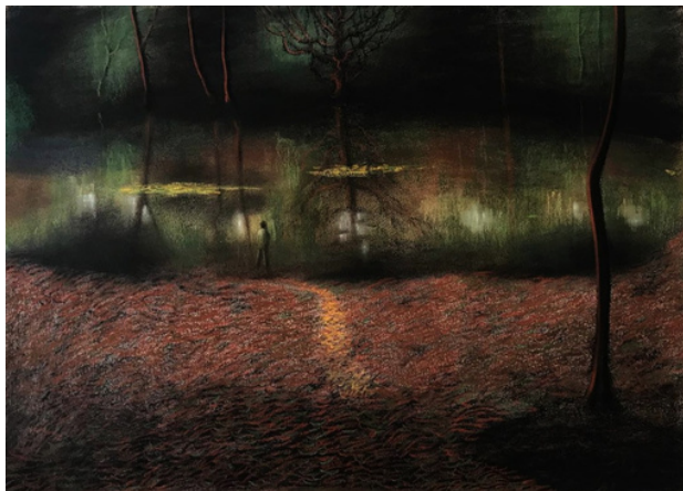
K Sudheesh Chasing the Sun's Last Breath, 2026 Soft Pastels on Paper 19.5 x 28 inches