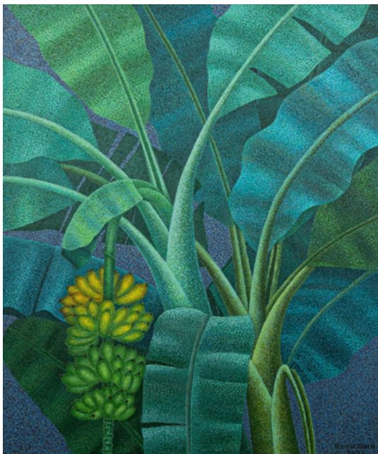
Roy K John Untitled 22, 2025 Acrylic on Canvas 36 x 30 inches