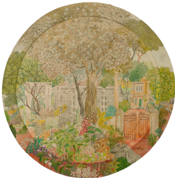
Sumanto Chowdhury Untitled, 2026 Colour pencils on paper board 41 x 41 inches