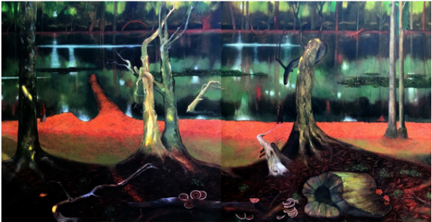
K Sudheesh The Weight of Stillness, 2026 Oil on Canvas 72 x 72 inches (Diptych)