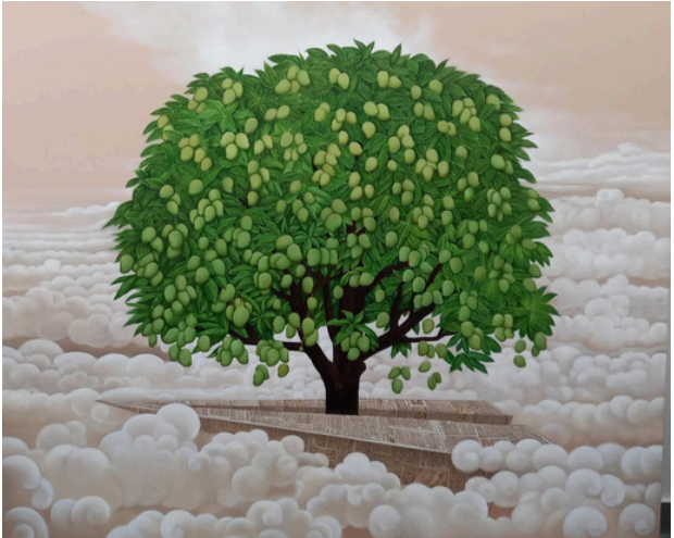
Lal Bahadur Singh Prakriti Acrylic on Canvas 48 x 60 inches

• 2008: B.F.A. in Painting from College Of Art, New Delhi.