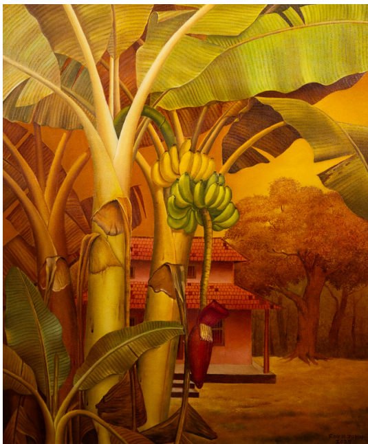
Roy K John Untitled - 16, 2025 Oil and Acrylic on Canvas 36 x 30 inches