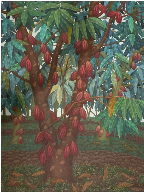
Roy K John Untitled Acrylic on Canvas 48 x 36 inches