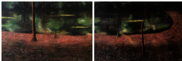
K Sudheesh Chasing the Sun's Last Breath - 2, 2026 Soft Pastels on Paper 19.5 x 28 inches (each -Diptych)