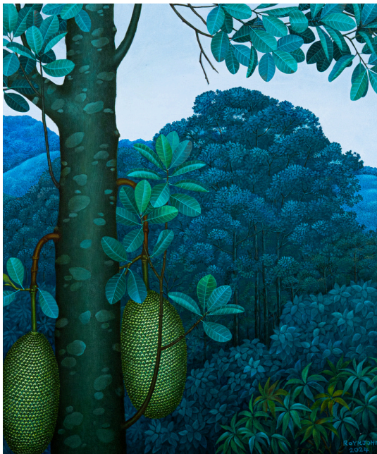
Roy K John Untitled - 7, 2024 Oil on Canvas 36 x 30 inches