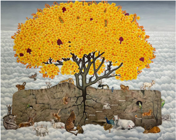
Lal Bahadur Singh Untitled, 2026 Acrylic on Canvas 48 x 60 inches