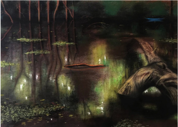
K Sudheesh Stillness, 2026 Soft Pastels on Paper 19.5 x 28 inches