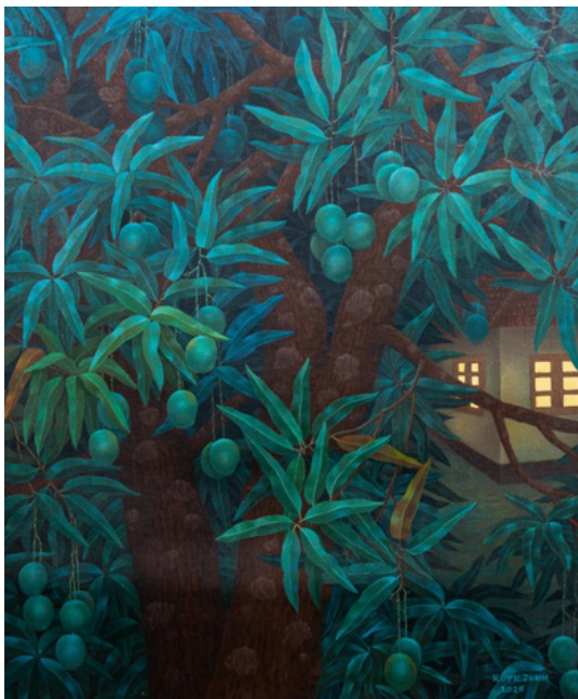
Roy K John Untitled 25 Acrylic on Canvas 36 x 30 inches