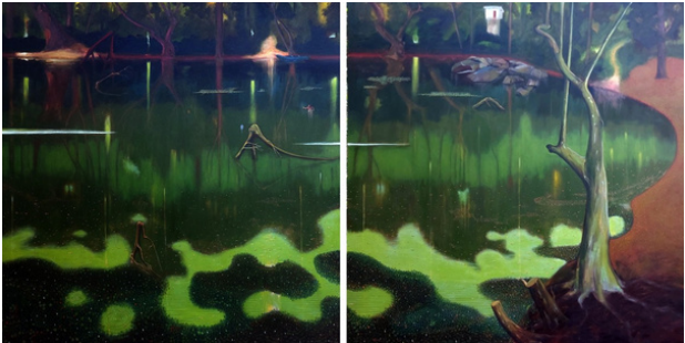
K Sudheesh The Lakes Low Hum, 2026 Oil on Canvas 72 x 72 inches (Diptych)